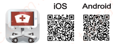
Healthy Check Pro