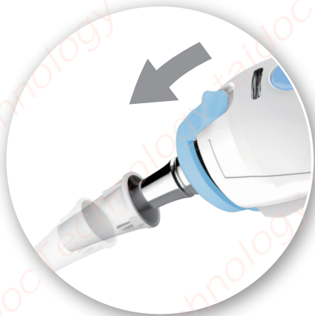
Eject Probe Filter