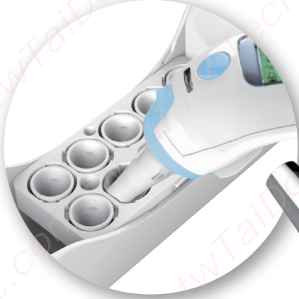
Apply Probe Filter